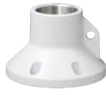
WV-QCLI01-W Mount Bracket